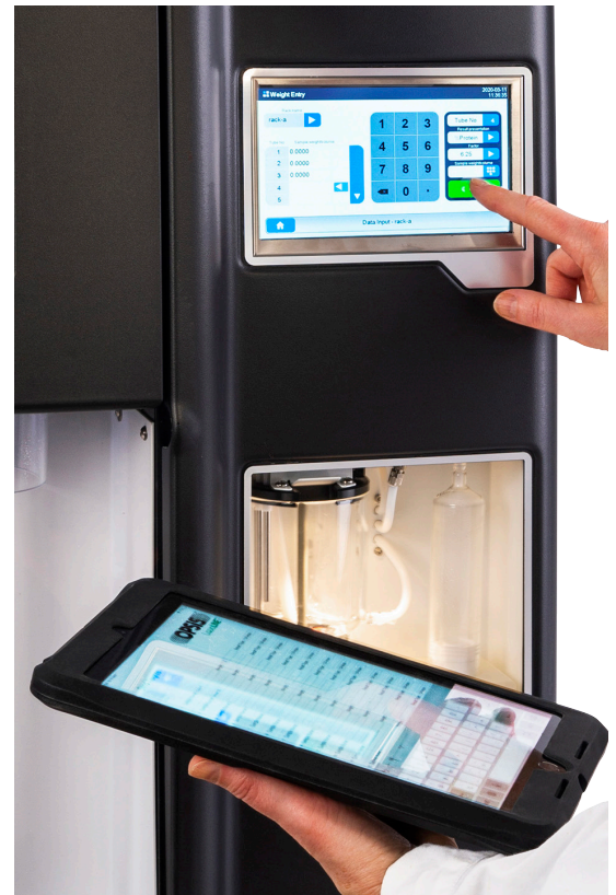
THE LABCONNECT SOFTWARE ALLOWS FOR EASY CONNECTIVITY TO YOUR LABORATORY